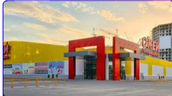
Food oriented retail