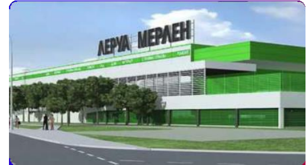
Non-food oriented retail