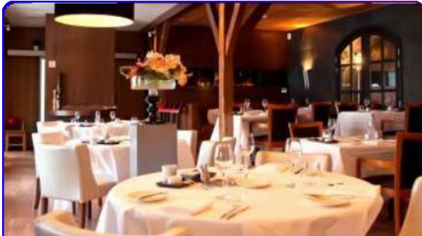
Restaurant business and food services